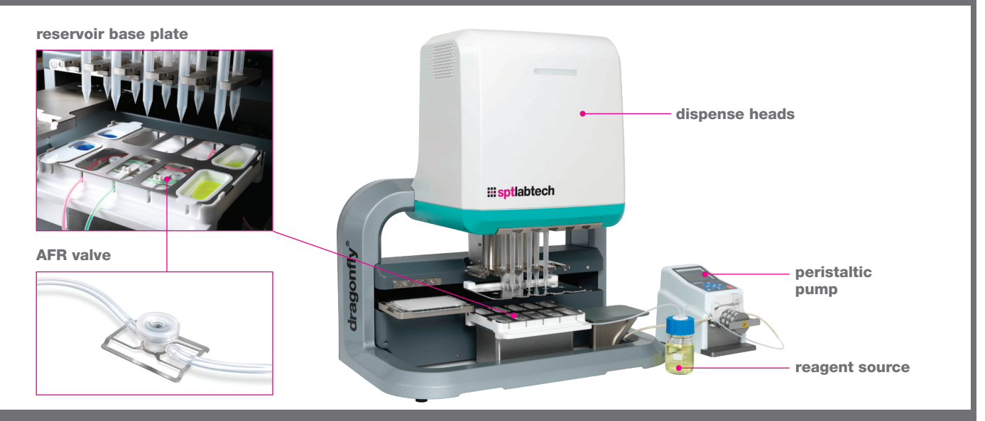
Fig 1: The dragonfly discovery instrument and auto-feed reservoir (AFR) dispense module.

Through collaboration with SPT Labtech, they evaluated the performance of the dragonfly discovery dispenser and its associated auto-feed reservoir module to